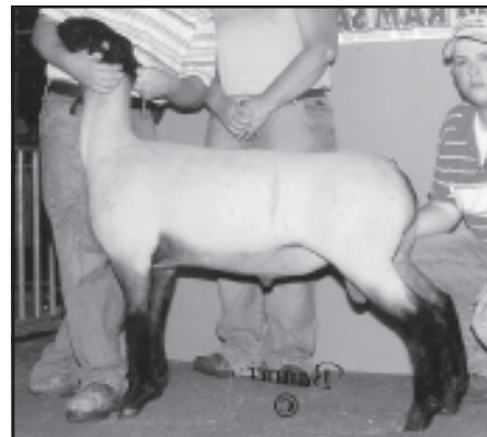
Reserve Champion Suffolk January Ram Lamb from Iowa at $1,750. Sold to Kansas buyer in the 2010 Midwest Classic Wether Sire Sale.

MAIL BIDS & CREDIT CARD PURCHASES WILL BE CHARGED A 5% CONVENIENCE FEE.