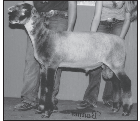
3rd January Ram Lamb at the 2010 Midwest Stud Ram Sale was a Wyoming entry.

B: 1/25/2011 Twin S: "Mossy Oak" Crago M8-7 X102551 D: Borchner BL89 U13701