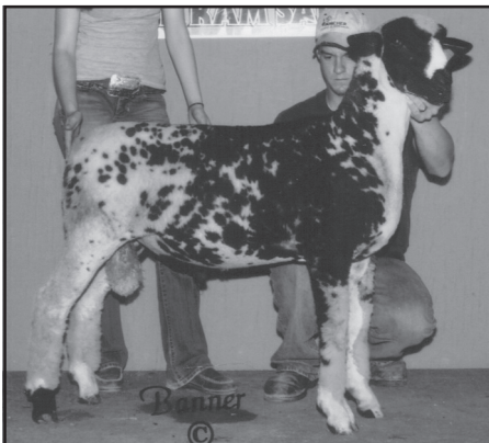
7th January Ram Lamb at the 2010 Midwest Stud Ram Sale sold to Indiana.