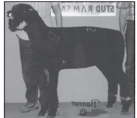
Grand Champion Yearling Ewe was a Colorado entry at the 2010 Midwest Stud Ram Sale, going to Ohio at $1,500.

MAIL BIDS & CREDIT CARD PURCHASES WILL BE CHARGED A 5% CONVENIENCE FEE.