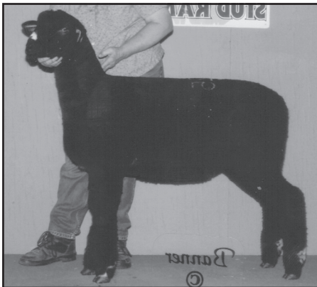
1st Fall Ewe Lamb at the 2010 Midwest Stud Ram Sale was an Ohio entry going to Missouri at $400.

MAIL BIDS & DELIVERY Call ASSISTANCE 573/442-8257 AVAILABLE