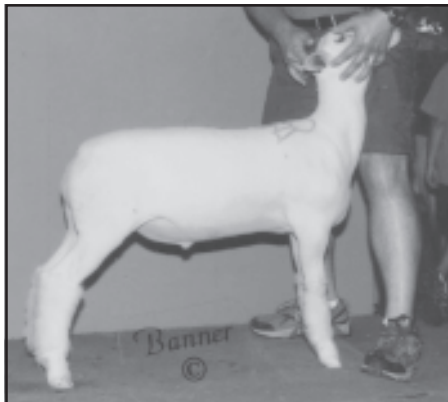
Champion Dorset Club Lamb in the 2010 Midwest Stud Ram Sale, an Iowa entry sold into Iowa at $200.