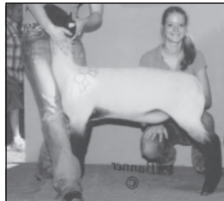
Reserve Champion Crossbred Club Lamb from Iowa sold at $600 to Arkansas in the 2010 Midwest Stud Ram Sale.