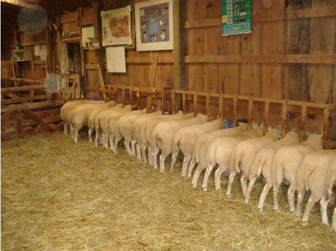
Texel Lambs from the Mels van der Laan Coldstream Ranch

Mels and Ruthanne van der Laan run about 50 registered Texel ewes. They first became interested in the Texel breed following a visit to some sheep farms in Holland in 1995. Their ewes have been acquired from embryo transfer from the Netherlands. Mels made arrangements with Rinus van Doorn to import 80 plus embryos with four blood lines. They have imported semen to enhance genetics every two years until the border closed due to BSE. To keep diversity in their flock they now search for unrelated top rams in Canada. This brings in NZ or Danish genetics, and they are happy to note by using these rams, their off spring are close to the pure Dutch Texel lambs. To put the muscle back into their lambs they are in the process of back breeding the new crop lambs to an unrelated Dutch Texel ram.