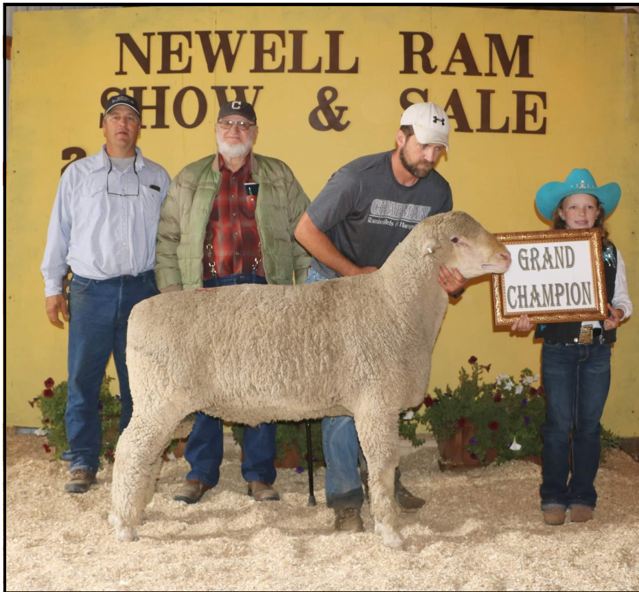
SUPREME CHAMPION RAM — NEWELL RAM SALE