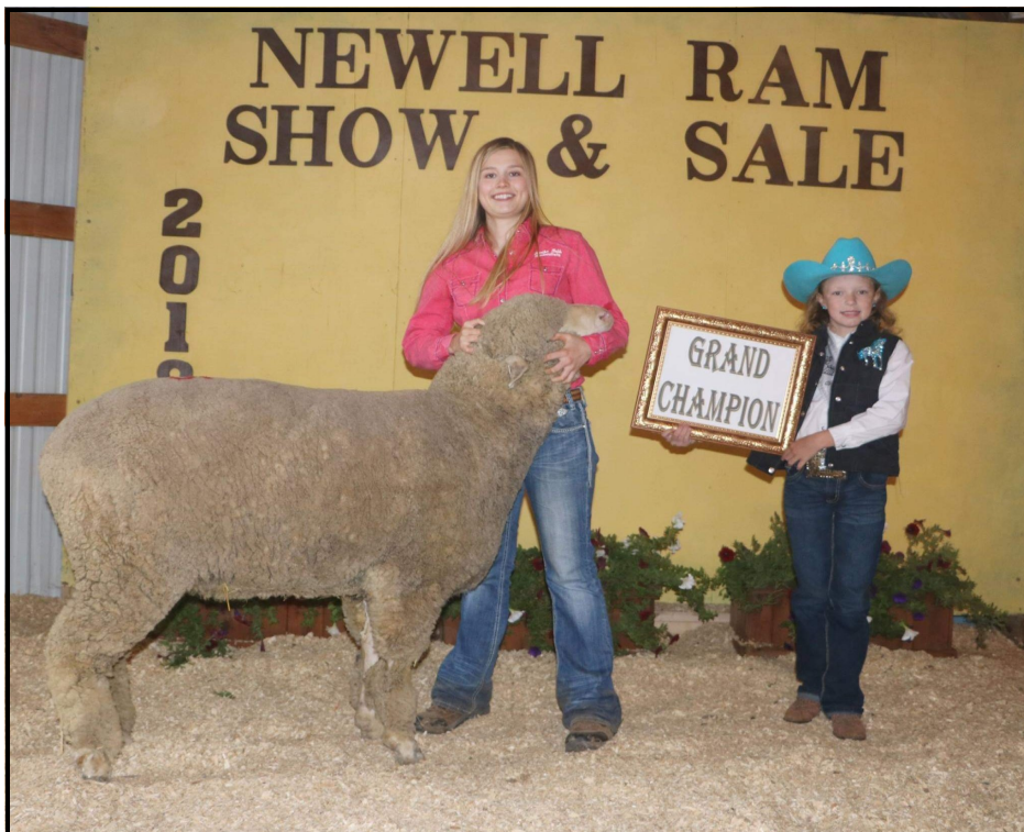
SUPREME CHAMPION EWE — NEWELL RAM SALE

WATCH THE WEBSITE THIS SPRING FOR ENTRY FORMS AND INFORMATION ABOUT THE 2019 NATIONAL RAMBOUILLET SHOW & SALE JULY 8-13, 2019 PIPESTONE, MINNESOTA