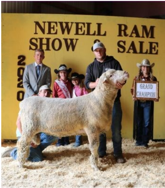
CHAMPION RAMBOUILLET AND GRAND CHAMPION RAM — NEWELL RAM SALE