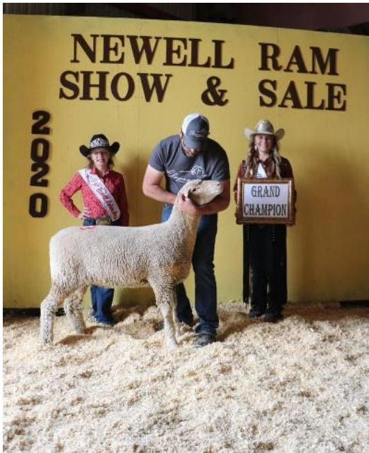
CHAMPION RAMBOUILLET EWE AND GRAND CHAMPION EWE — NEWELL RAM SALE

WYOMING RAM TEST as of 11/17/20 75 TOTAL RAMS ON TEST FROM 13 PRODUCERS—52 ARE RAMBOUILLETS ADG was .91 Highest ADG was 1.31