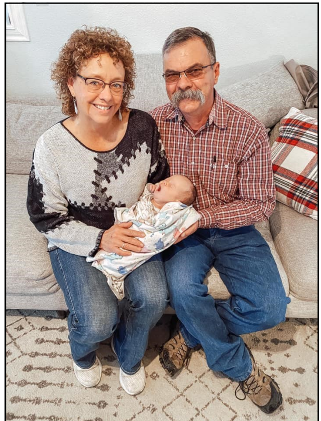
Lots of news for the Bauer Family!