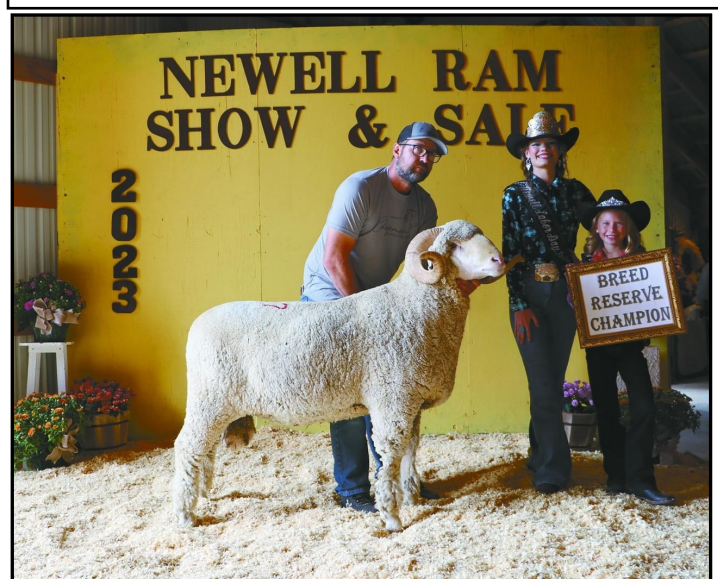
Top Selling Ram Lot 17 Consigned by Chapman Rambouillets, Bison, SD sold at $3200