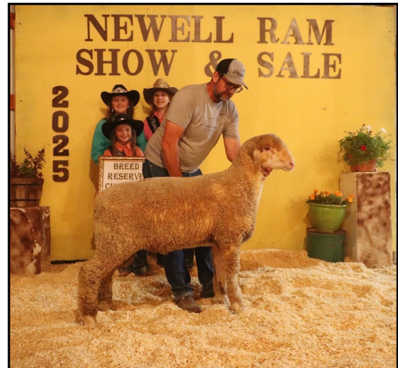
Reserve Champion Rambouillet Ram consigned by Chapman Rambouillets, Bison, SD