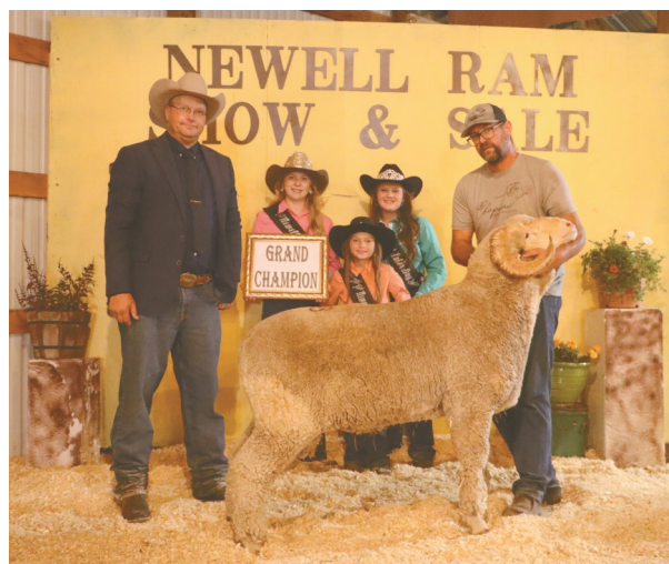
Champion Rambouillet Ram and Supreme Champion Ram

https://auction.frontierlivesale.com/100th-Annual-Montana-Ram-Ewe-Sale_as110654