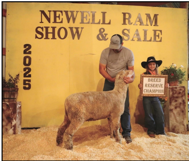
Reserve Champion Rambouillet Ewe consigned by Chapman Rambouillets, Bison, SD