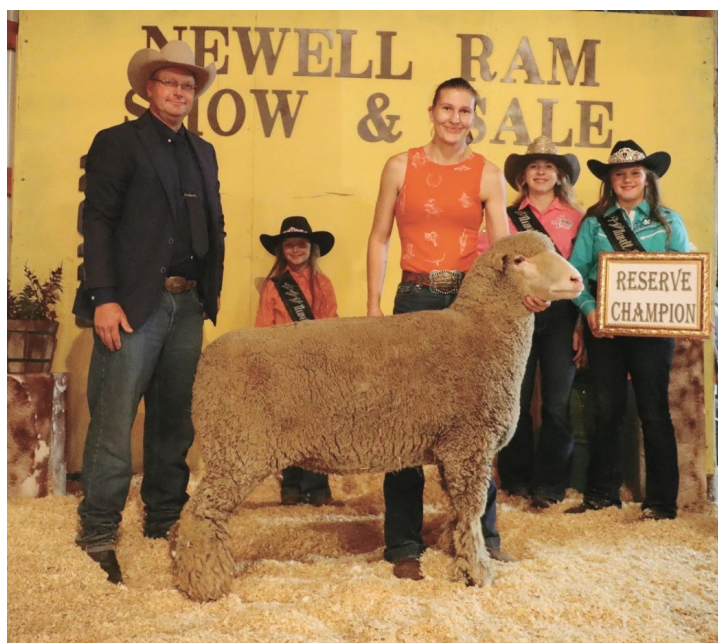
Reserve Supreme Champion Rambouillet Ewe

Rabel Bros of Buffalo, WY exhibited the Youth Champion Fleece