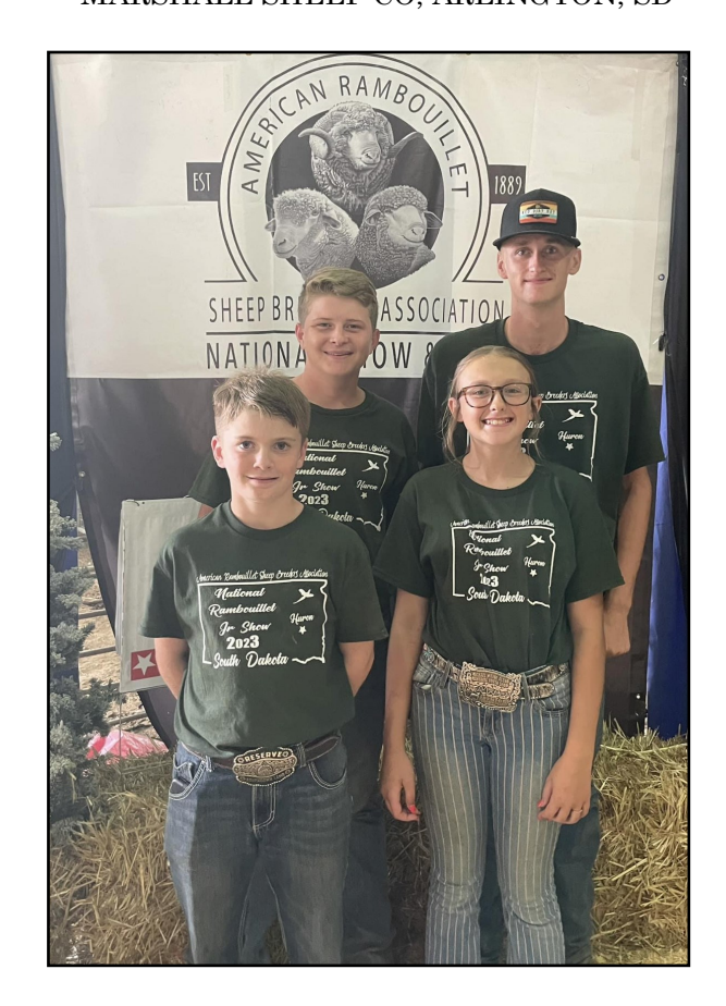
2023-24 Junior ARSBA Officers