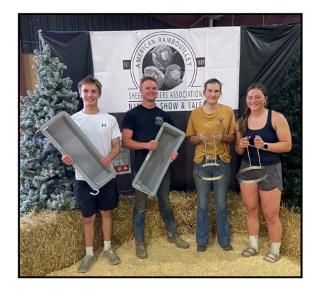
Junior Cornhole Winners

VISIT THE WEBSITE FOR A COMPLETE LIST OF SALE REPORTS AND WINNERS FOR THE