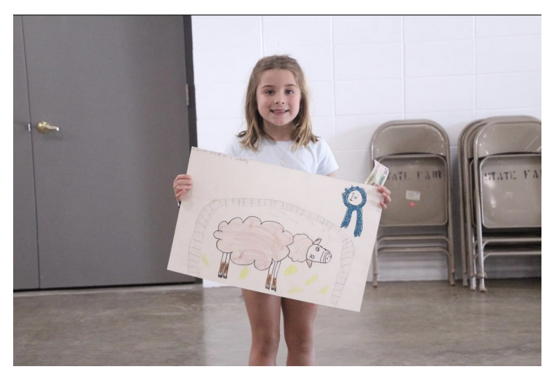
2023 NATIONAL JUNIOR SHOW CHAMPION RAM