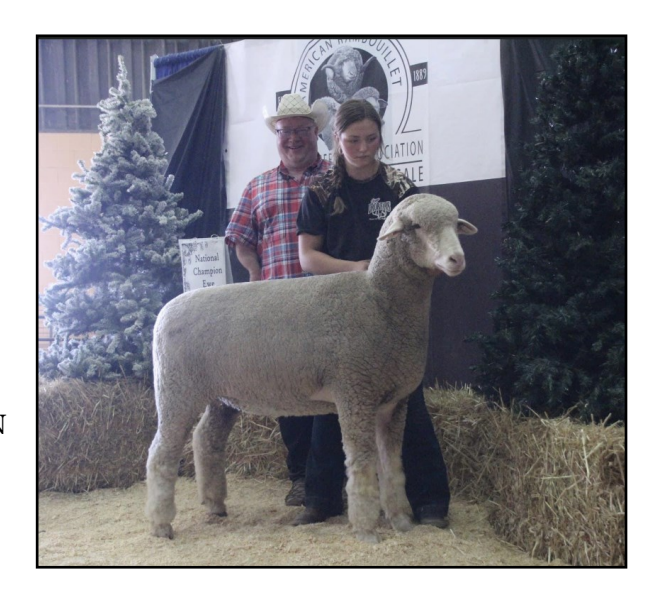
2023 NATIONAL CHAMPION RAMBOUILLET EWE

DEW DROP FARMS, NEW YORK MILLS, MINNESOTA