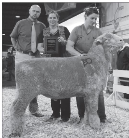
Pictured are the 2018 Champions!