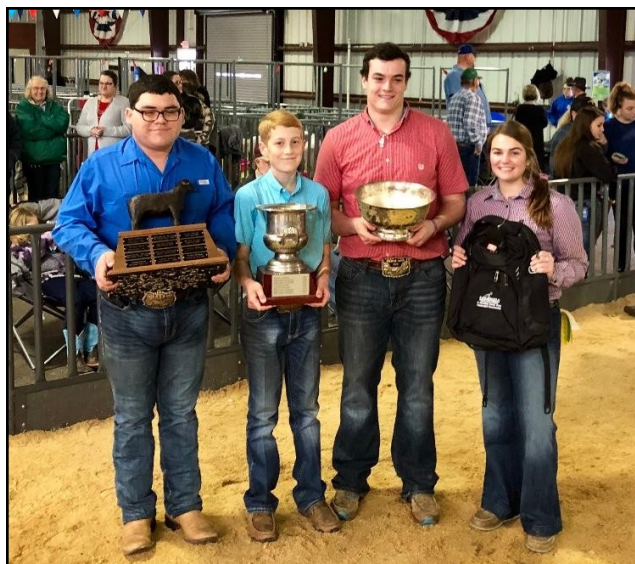
San Angelo Rambouillet Junior Show Winners!

Rush orders and Non-Members: DOUBLE FEES